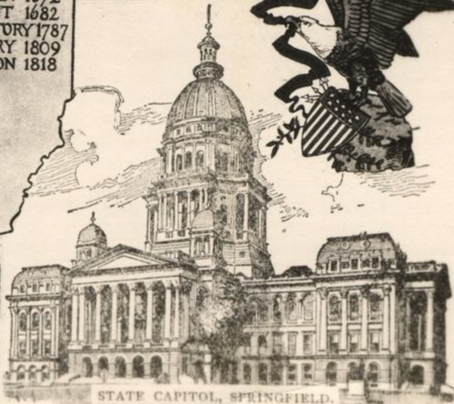
STATE CAPITOL, SPRINGFIELD.